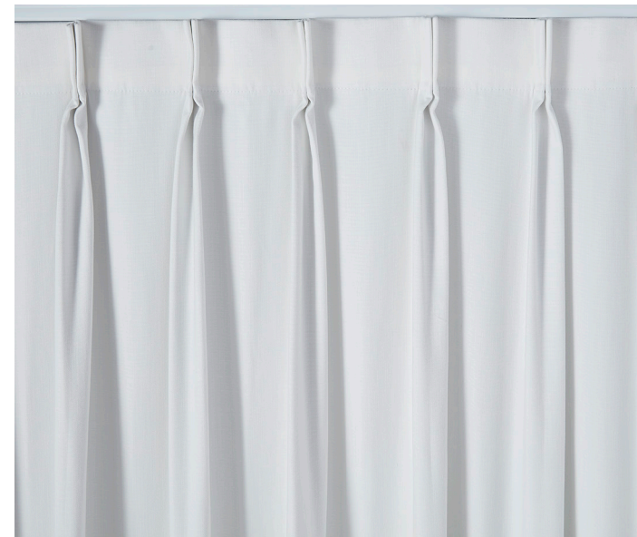
Double Pinch Pleat