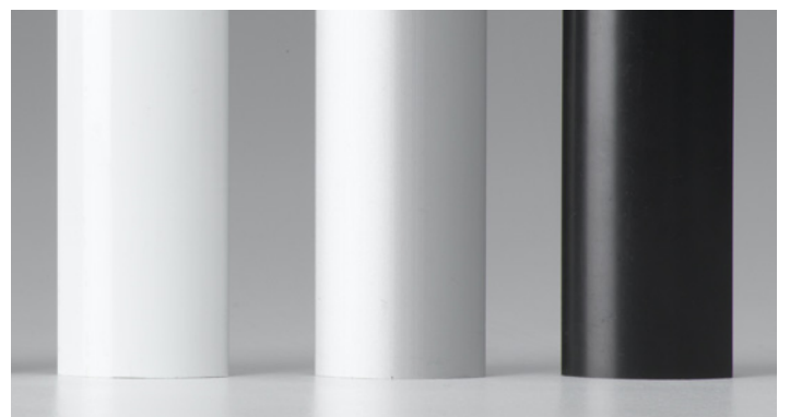
White, Anodised and Black Ellipse Bottom Rail