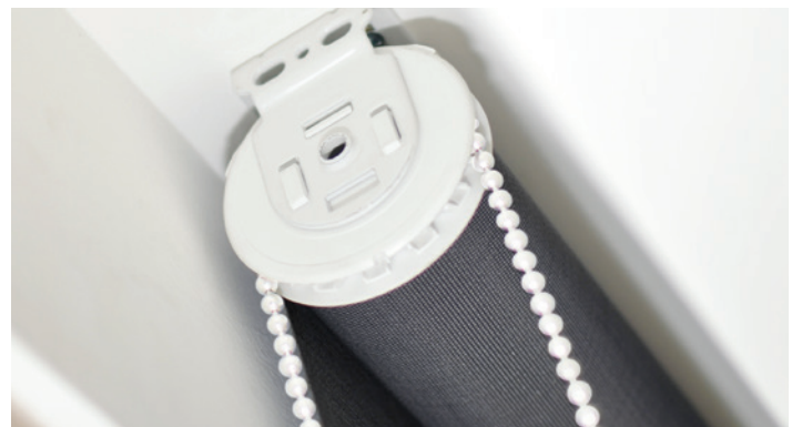
Black or White Hardware